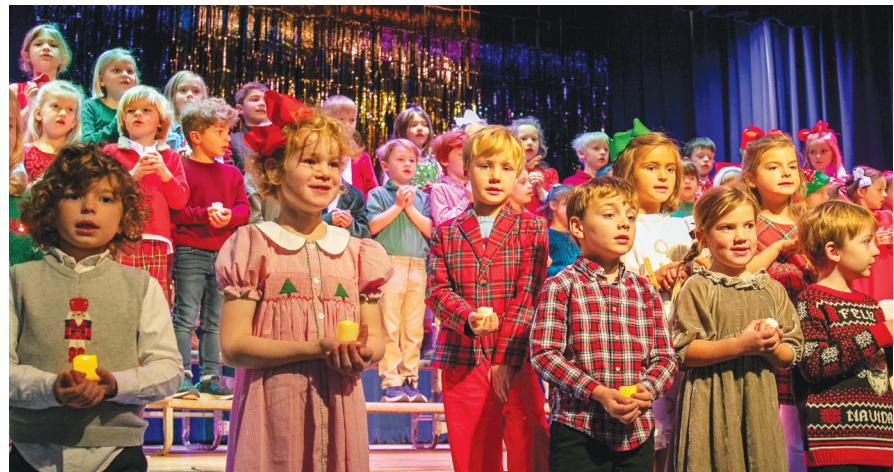
Kindergarten class performing a holiday favorite

considerations, this beloved tradition had to take place virtually in 2020 and was pushed forward to a spring program last year, so it was wonderful to see the